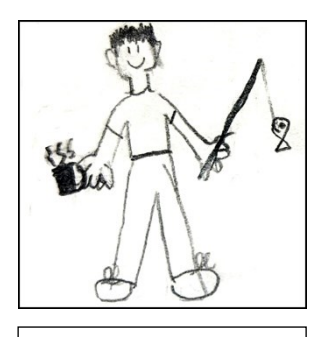
Simon, drawn by Tess Vander Hoek

The votes of the "Let's Draw Simon and Thomas LeClair for the Directory" Contest have been tallied! It was very close, but two drawings rose the top of the votes. The winners are the following: